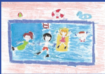
Pai is 15 and she wants to be an air hostess