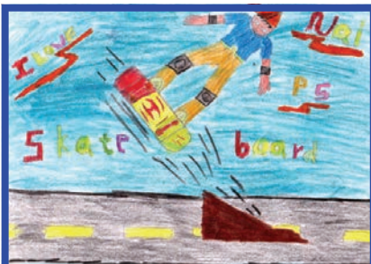
Nai is 12 and when he grows up he wants to be a rescue officer