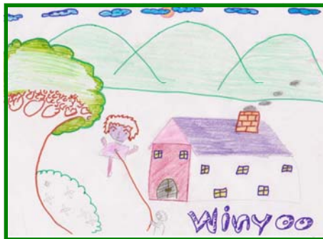
Winyoo, Age 13—2nd place

At Coconut Club we ran a drawing contest: