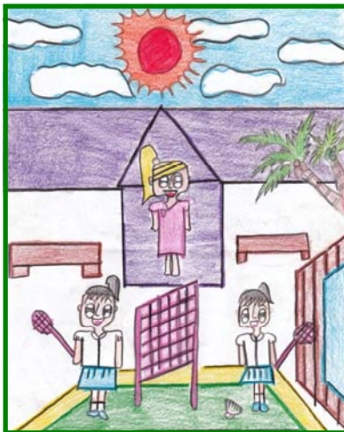
On, Age 14—1st place

"I want to learn English because I want to be an airhostess" Pai, aged 15