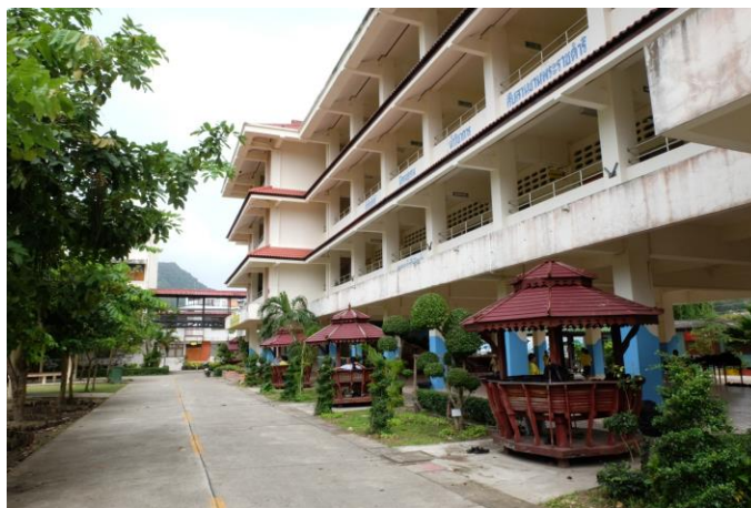
The Rajaprachanukroh (RPG) 36 School also known as Kamala School

In 2016, we taught English for free to over 1,200 children aged from 3 to 18 in three Government schools in Phuket: Baan Kalim School, The Rajaprachanukroh (RPG) 36 School in Kamala, and Kamala Children Development Center (KCDC).